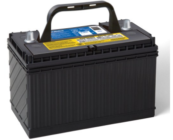
31-901CT / 31APFleet / 1151 / 1111