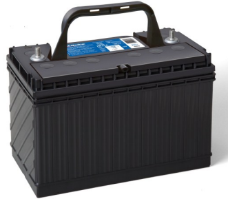
31-900CT / 31TSFleet / 1150 / 1110 / DC31